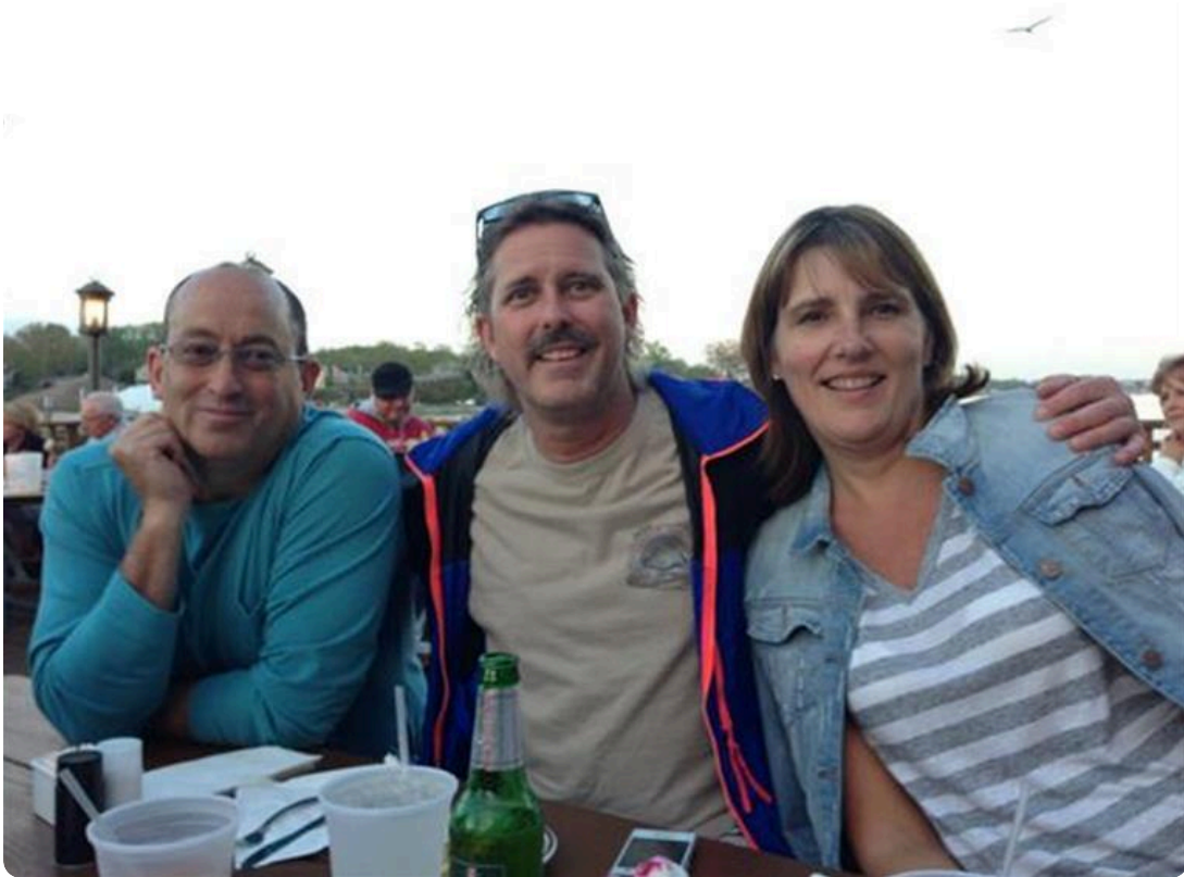
Mikes Crab Deck